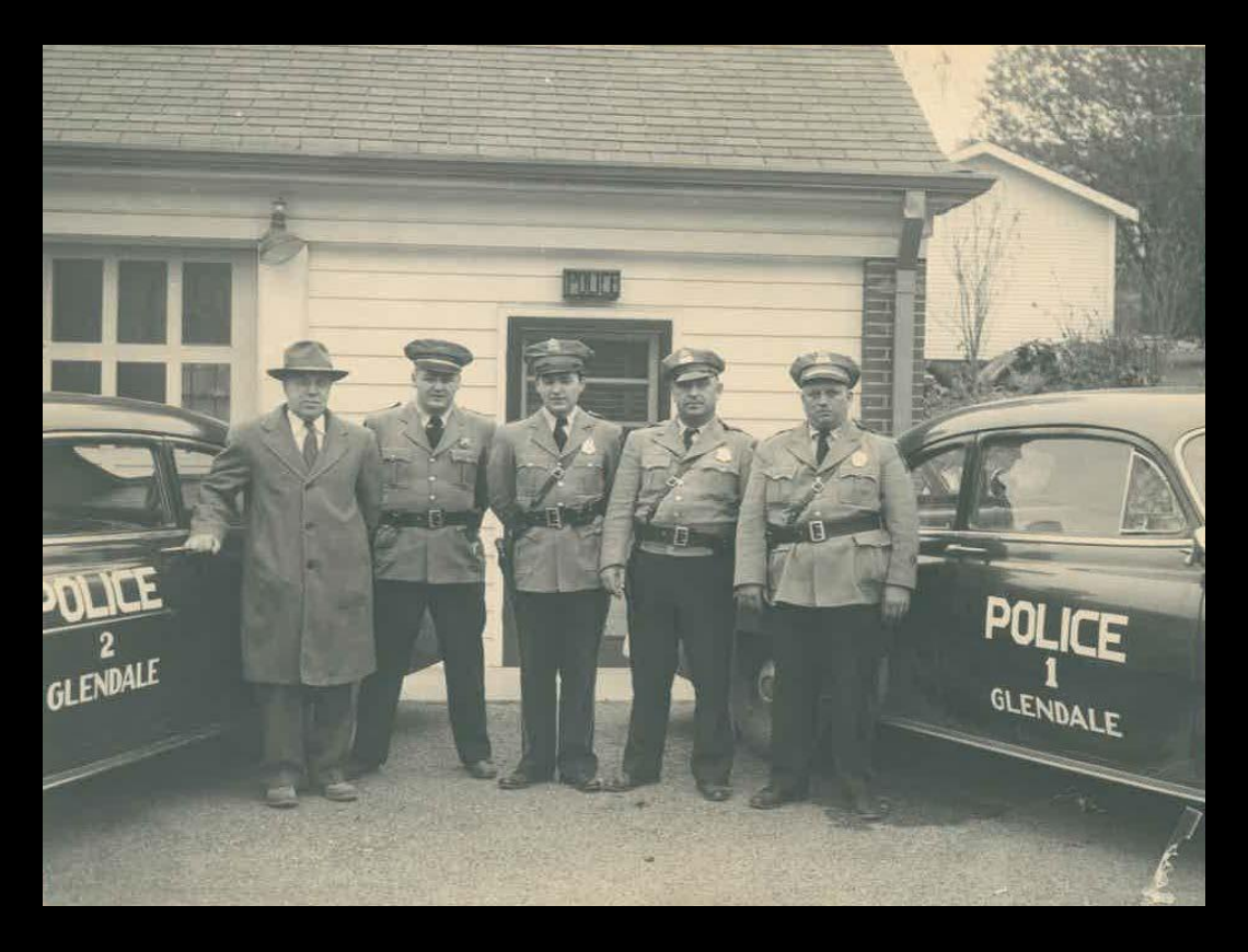
in the 1950's